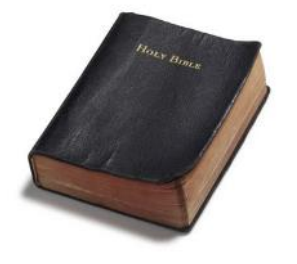
The Bible is the Word of God